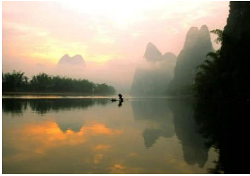
The Yellow Cloth Shoal